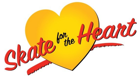
Figure Skating Club Offer to "Skate for the Heart" at the Sears Centre Arena